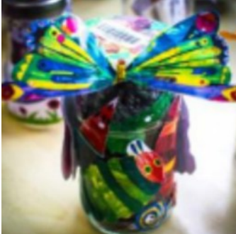
The Very Hungry Caterpillar

For World Book Day this year, we will be encouraging our children bring in books for a big book swap on Thursday 5 th March. Additionally, we will also be holding a 'Book in a Jar' competition. The idea is to pick a book and fill an empty jar with items (or pictures) that are featured in that book or story. For example, you may want to include some leaves, mud and a little bear to represent 'We're Going on a Bear Hunt,' by Michael Rosen. Below you will see some photos of possible ideas below and there are other ideas online, but your ideas can be as creative or as simple as you like. The idea is to have fun as a family and celebrate our love of reading. We hope that lots of you will enter!