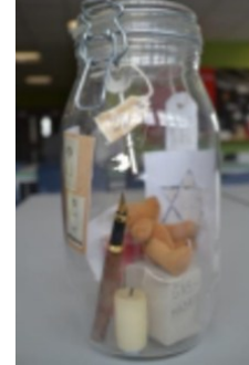
The Diary of Anne Frank