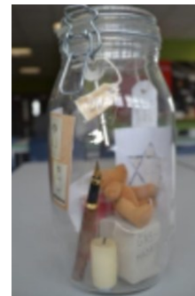
The Diary of Anne Frank