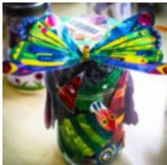
The Very Hungry Caterpillar

For World Book Day this year, we will be encouraging our children bring in books for a big book swap on Thursday 5 th March. Additionally, we will also be holding a 'Book in a Jar' competition. The idea is to pick a book and fill an empty jar with items (or pictures) that are featured in that book or story. For example, you may want to include some leaves, mud and a little bear to represent 'We're Going on a Bear Hunt,' by Michael Rosen. Below you will see some photos of possible ideas below and there are other ideas online, but your ideas can be as creative or as simple as you like. The idea is to have fun as a family and celebrate our love of reading. We hope that lots of you will enter!